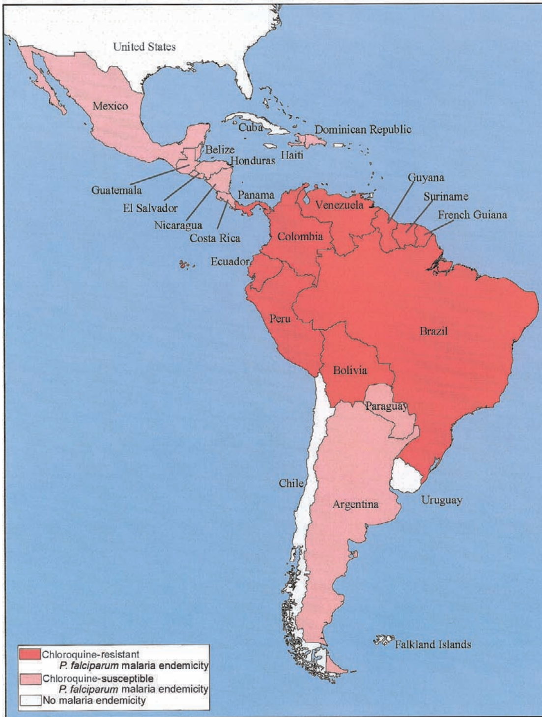
Figure 1. Map of malaria epidemiology in the Americas. Delineation is made between areas with chloroquine-susceptible Plasmodium falciparum malaria and chloroquine-resistant P. falciparum malaria. The map is courtesy of the Centers for Disease Control and Prevention and is used with permission.